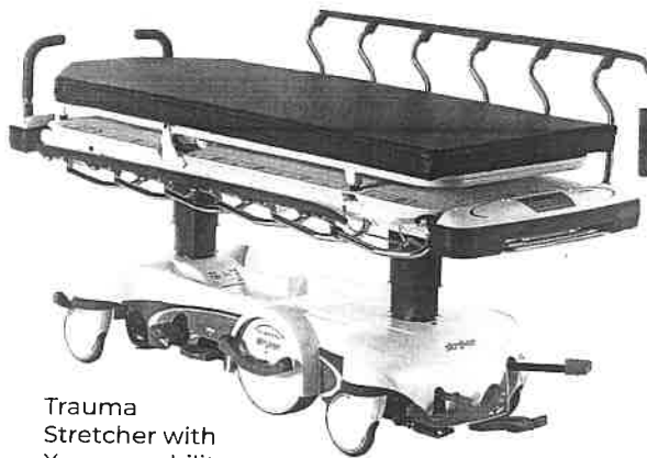
Trauma Stretcher with X-ray capability

a district spanning approximately 2,500 square miles. Sally, and the volunteer board are committed to improving community health and helping guide the Foundation's mission to support Cook Hospital and ensure that residents across our large rural hospital district have access to modern healthcare close to home.