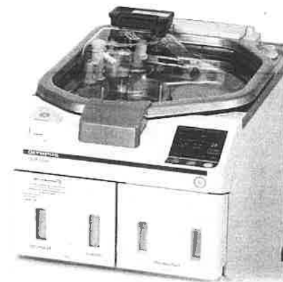
OER-ELITE Endoscope Preprocessor

Your ongoing donations directly support our critical mission to provide much needed new medical equipment to Cook Hospital, and to provide quality healthcare in our rural community.